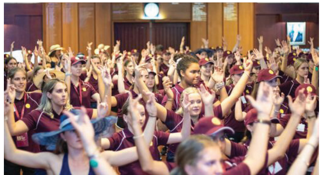
2020 Students rehearsing their Fresher Dance at O-Week.

Our mission is to create an inclusive and nurturing environment that allows our residents to achieve their academic potential and to form lasting relationship with their peers.