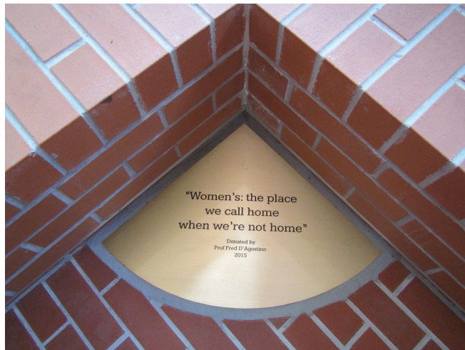
A plaque in the Centenary Wing ground floor.