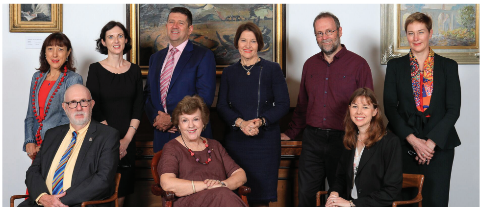
2019 Women's College Council members