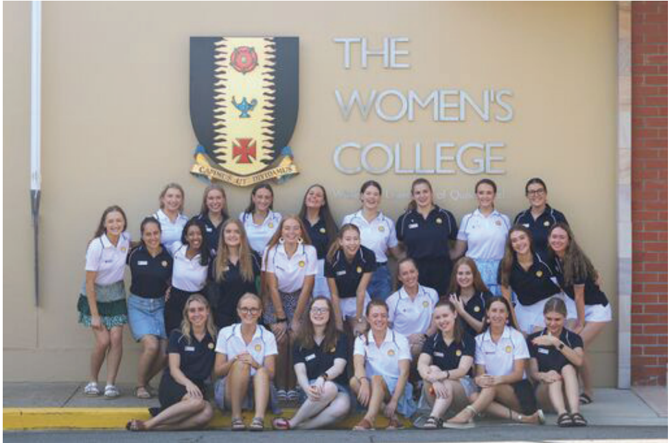
2020 Student Leadership Team.